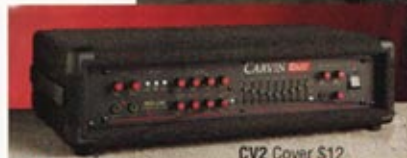
CV2 Cover $12 SV2 Optional 2-space Duratuff II™ cabinet $29. Ship $7

Look in any professional rack system and the one thing you will find is a good compressor right at the heart of it. So we squeezed one of those in too. Now this isn't one of those inexpensive units you find in most bass amps. This is a studio quality soft knee compressor / limiter with separate threshold and ratio controls. Crank up the Ratio control to get that tight and punchy sound that slappers crave, or back it down for some subtle dynamic reduction to give the bass a big and full sound. The Threshold control gives you total control when the compressor kicks in.