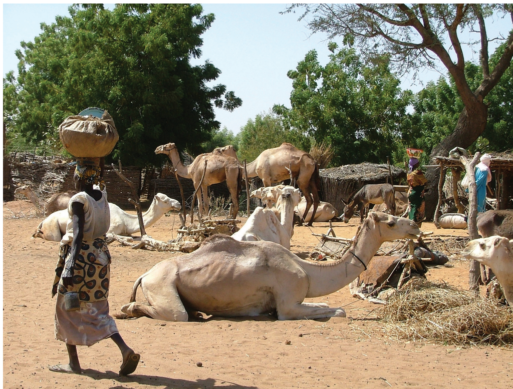
Matt Nimmeln: Belayara, Niger