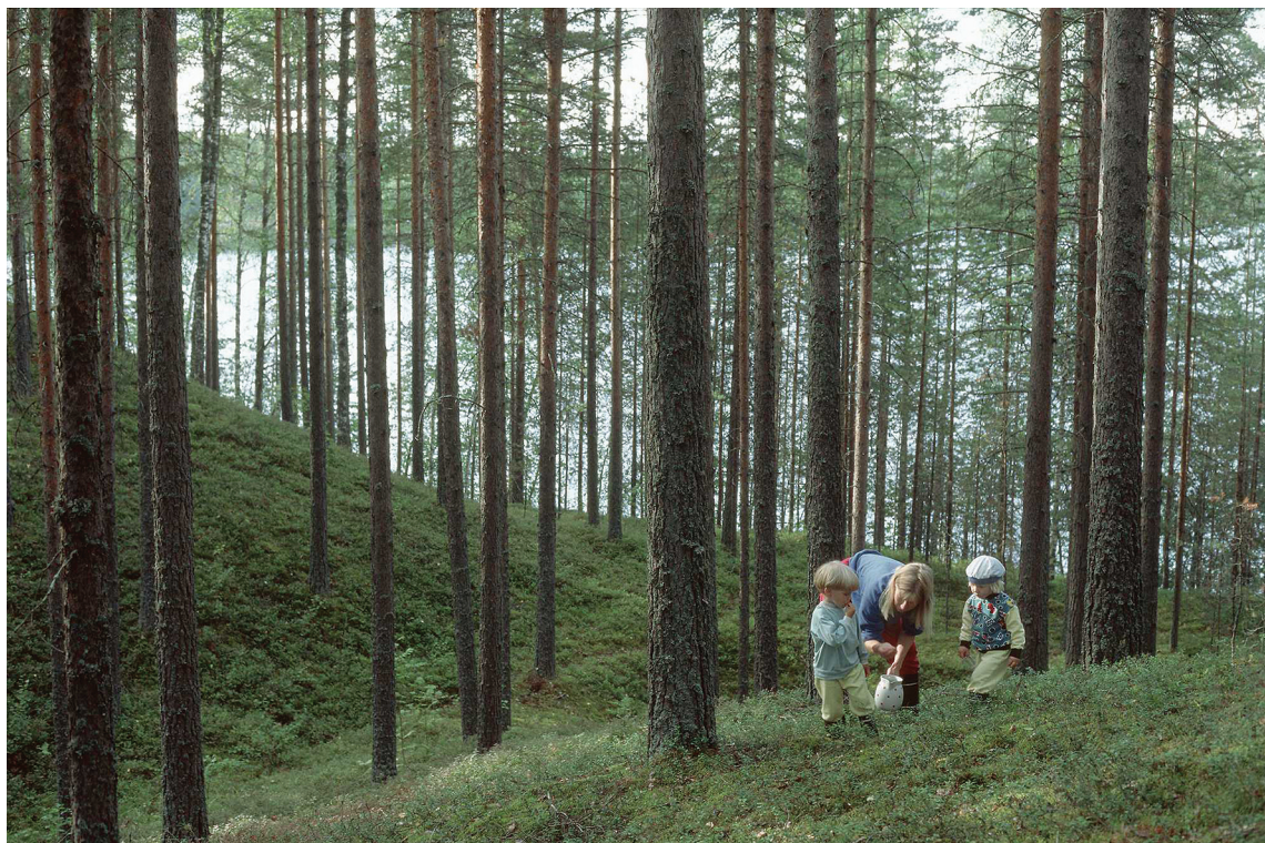
Erkki Oksanen: Boreal forest, Finland

Photo 1.1 Forests provide multiple tangible and intangible benefits. The same forest area can for example provide wood, non-wood forest products such as wild berries, clean water and an environment for recreation.